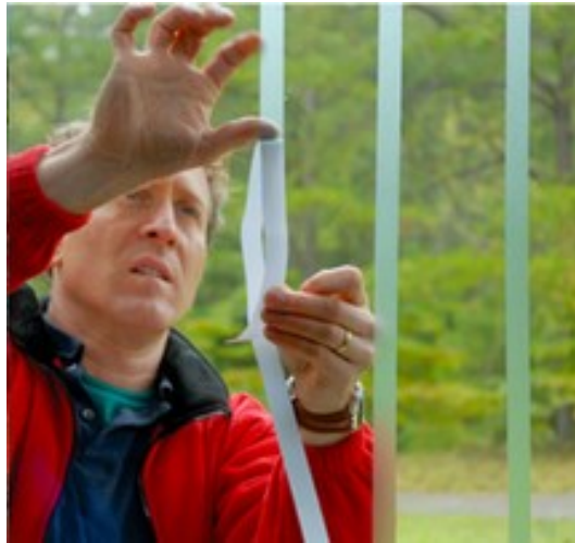
ABC Bird Tape— abcbirdtape.com

Made from inexpensive paracord found at hardware and craft stores.