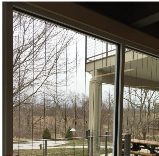
Acopian Bird Savers—Inside View