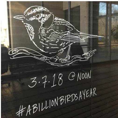
Chalk Marker Drawings—wet-erasable markers available in craft stores.

Features you may already have in your home that protect birds: