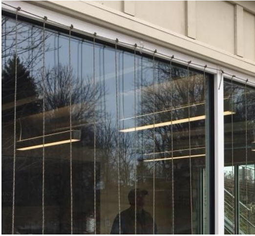
Acopian Bird Savers—Outside View

Up to one billion birds are lost to window collisions in North America every year . . . . Almost half hit home windows. You can make a difference with these do-it-yourself options.